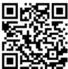
ZX10-EX 3D demo